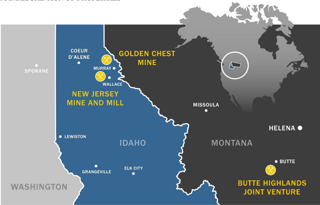
Figure 1 - Project Location Map