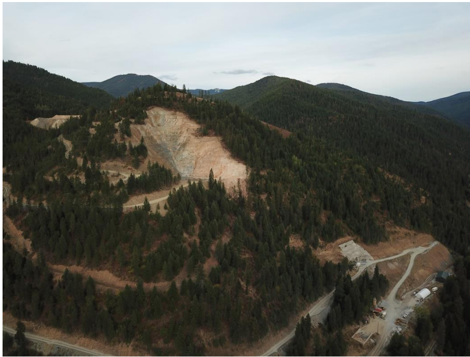
Figure 2 - Photo of New Golden Chest Mine in September 2018